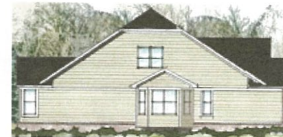
Revised Cape Cod