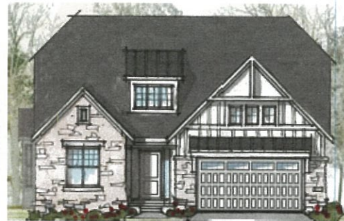
Revised Cape Cod