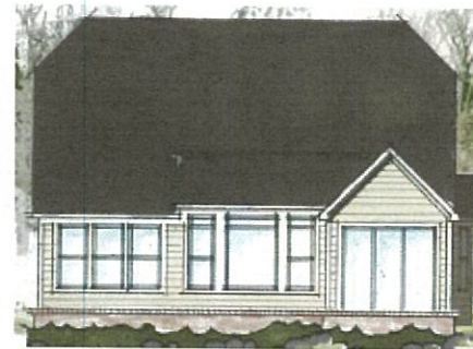
Revised Cape Cod