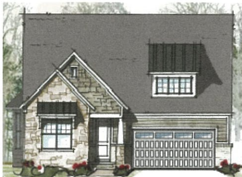
Revised Cape Cod