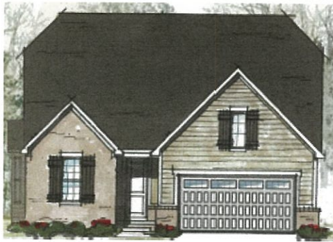
Revised Cape Cod