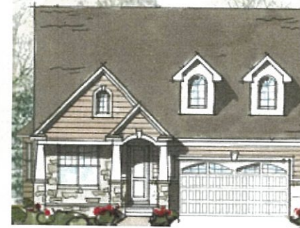
Revised Cape Cod