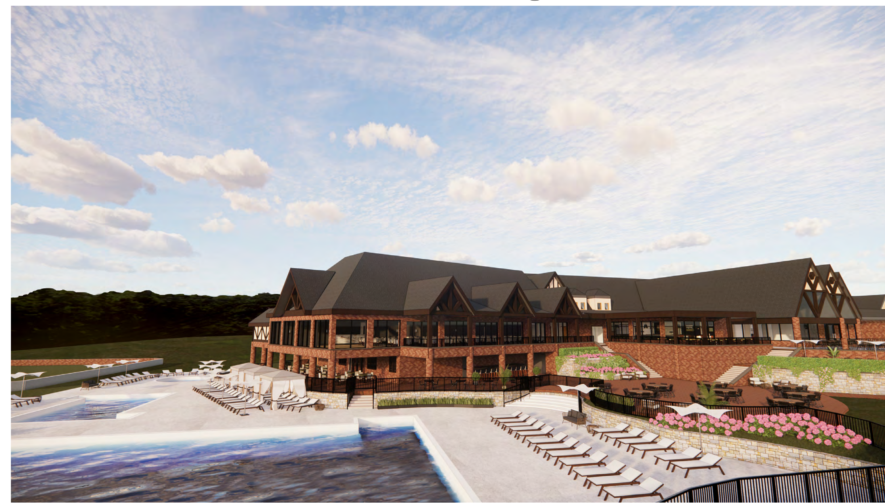
2 EXTERIOR SE CLUBHOUSE - SOUTH EXPANSION

PROJECT CLUBHOUSE RENOVATION MEADOWBROOK COUNTRY CLUB 40941 EIGHT MILE ROAD NORTHVILLE MI 48167