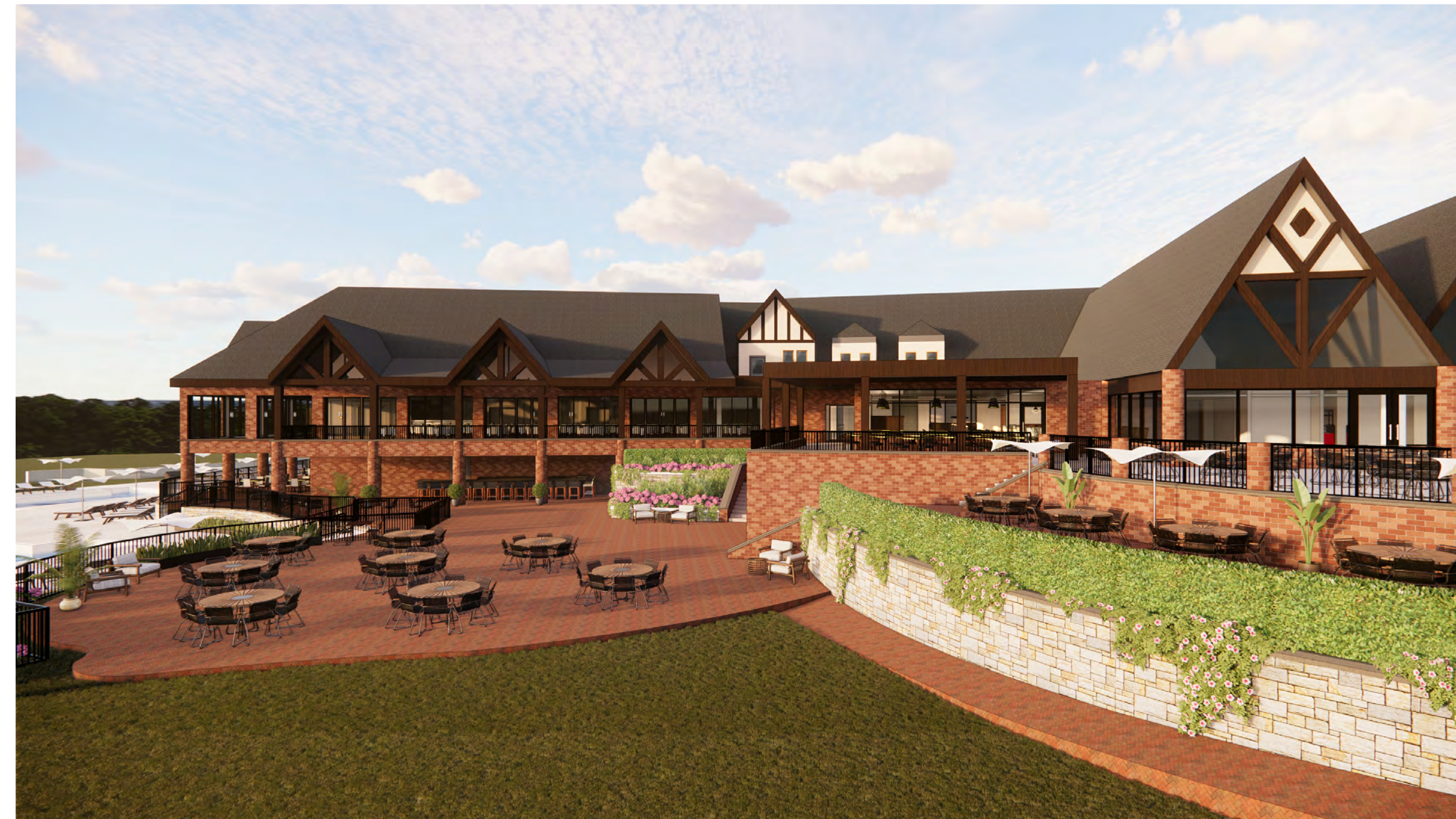
1 EXTERIOR E CLUBHOUSE - SOUTH EXPANSION 1A