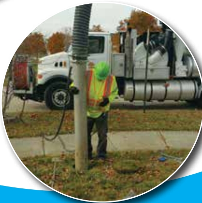
Removing blockage caused by FOG