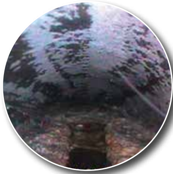
View of FOG build-up inside sewer pipe